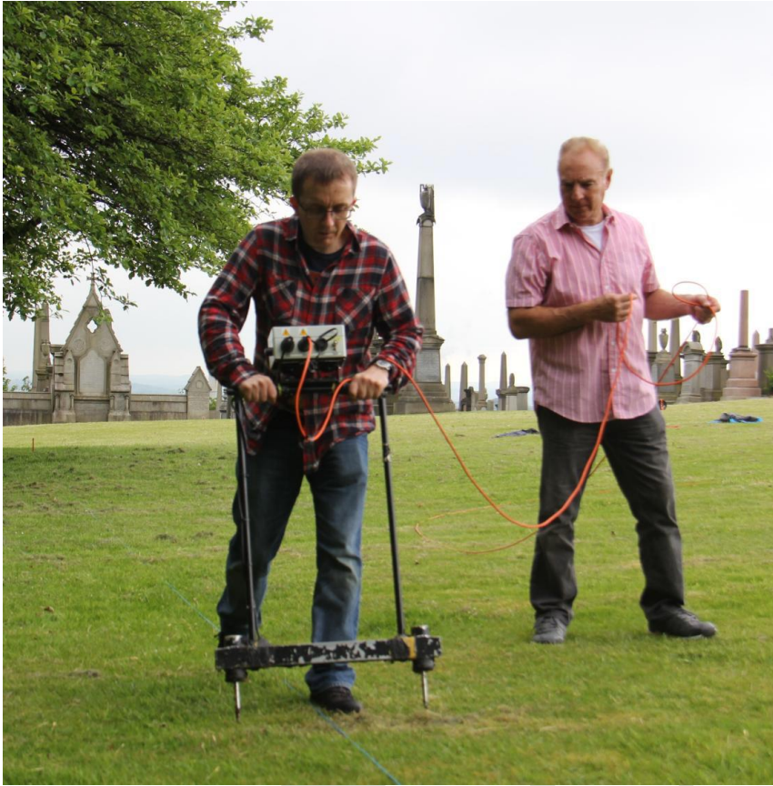
Figure 1: Volunteers performing resistivity survey – note grid-line marked by blue string.

ensure they have no metal on their person – for example on clothing or jewellery, as this would interfere with measurements.